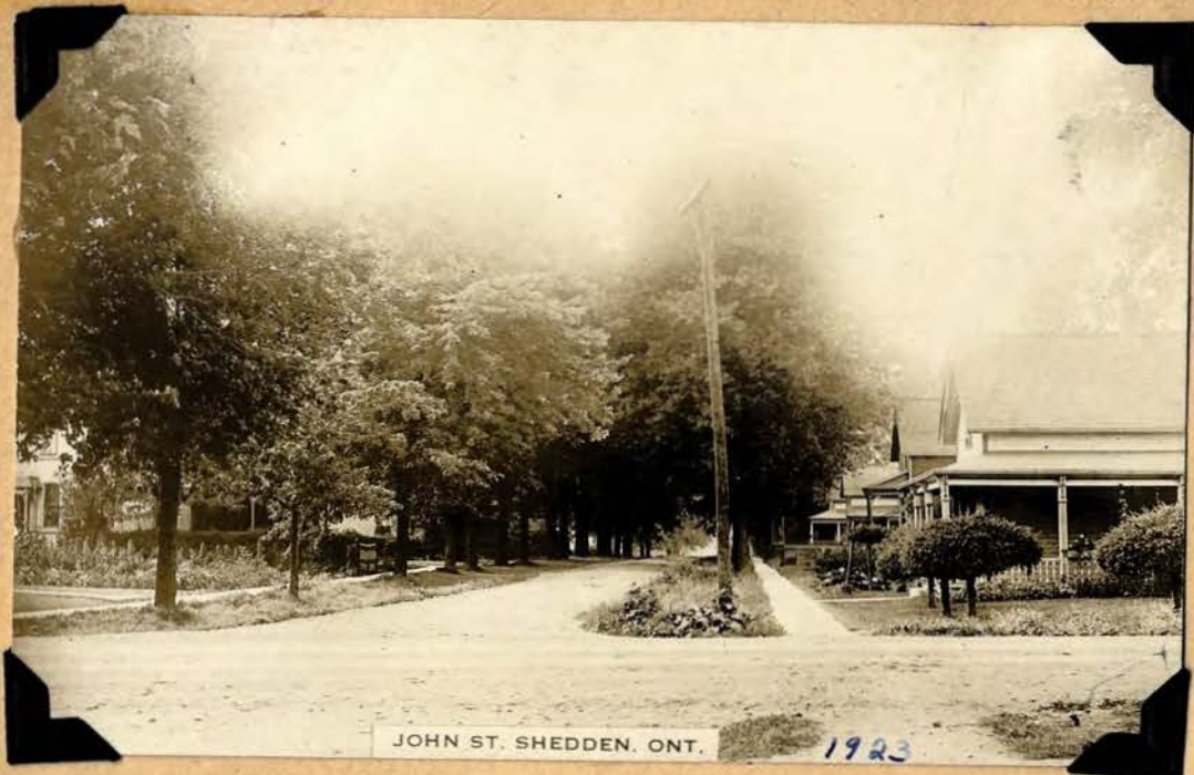
JOHN ST. SHEDDEN, ONT.