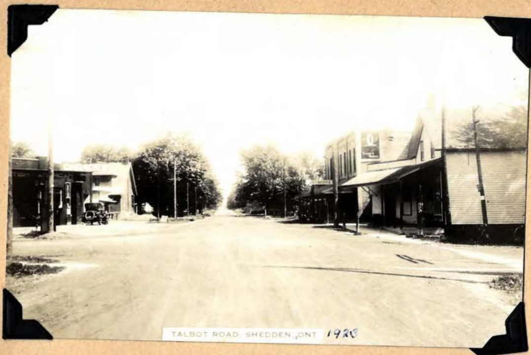
TALBOT ROAD, SHEDDEN, ONT 1920