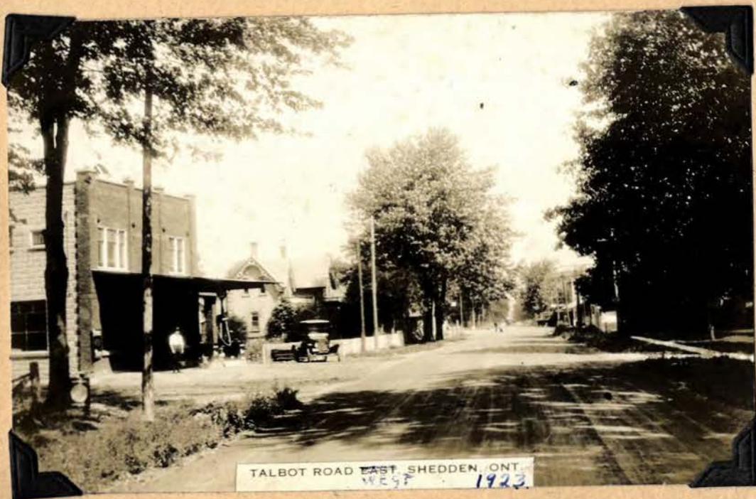
TALBOT ROAD EAST, SHEDDEN, ONT 1923