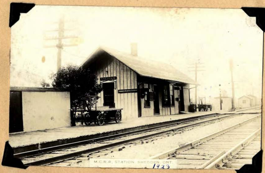
M.C.R.R. STATION SHEDDEN, ONT.